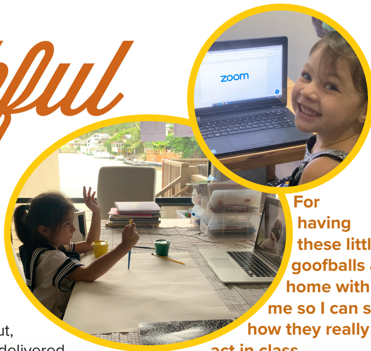
For having these little goofballs at home with me so I can see how they really act in class.