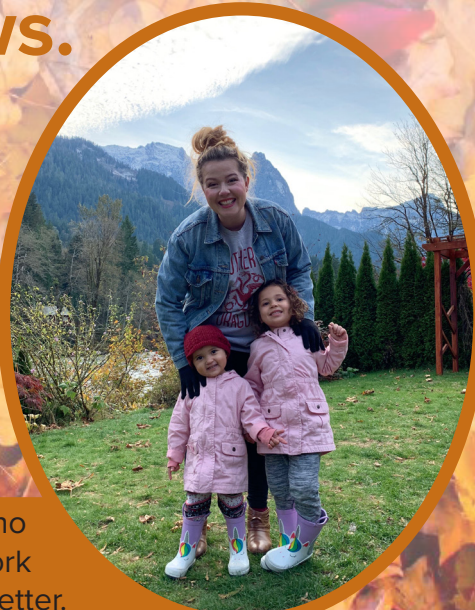
For my family who inspire me to work harder and be better.