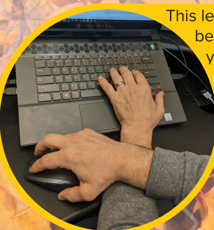
This left-handed mouse, because sometimes you need a change in perspective to produce great work.